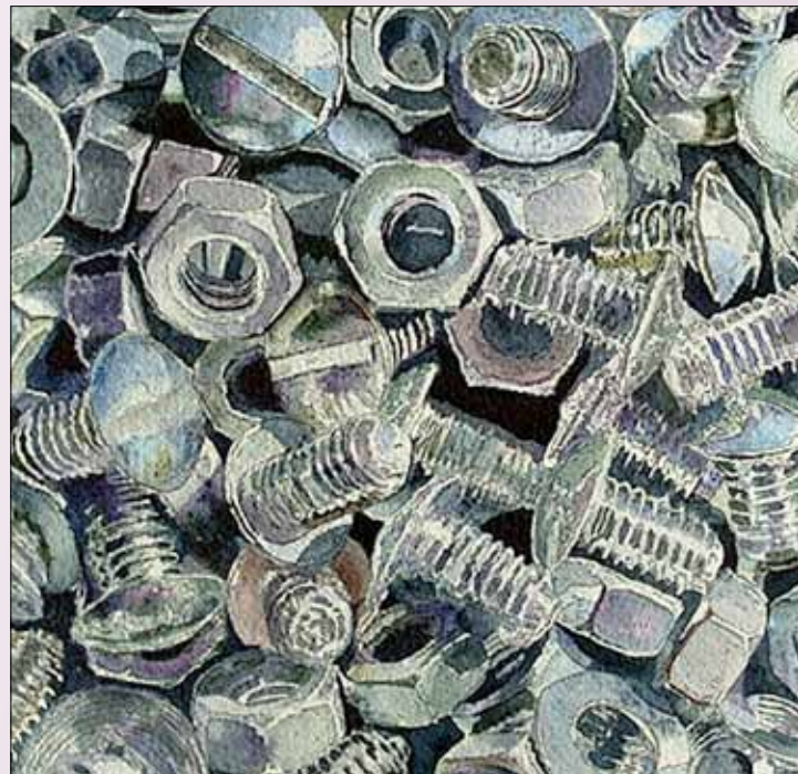
Nuts and Bolts