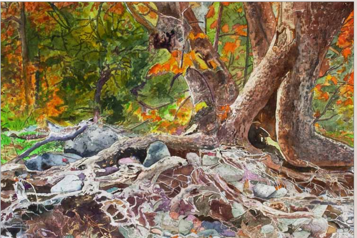
The Old Tree