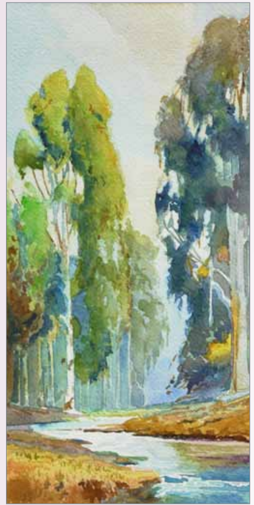
Near Carmel FOR SALE