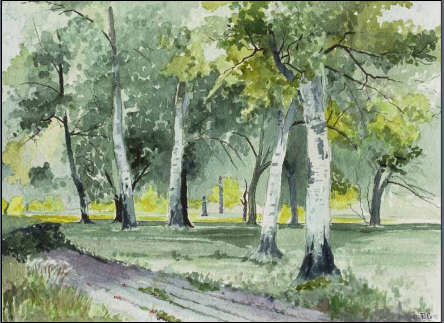
Etude in Green