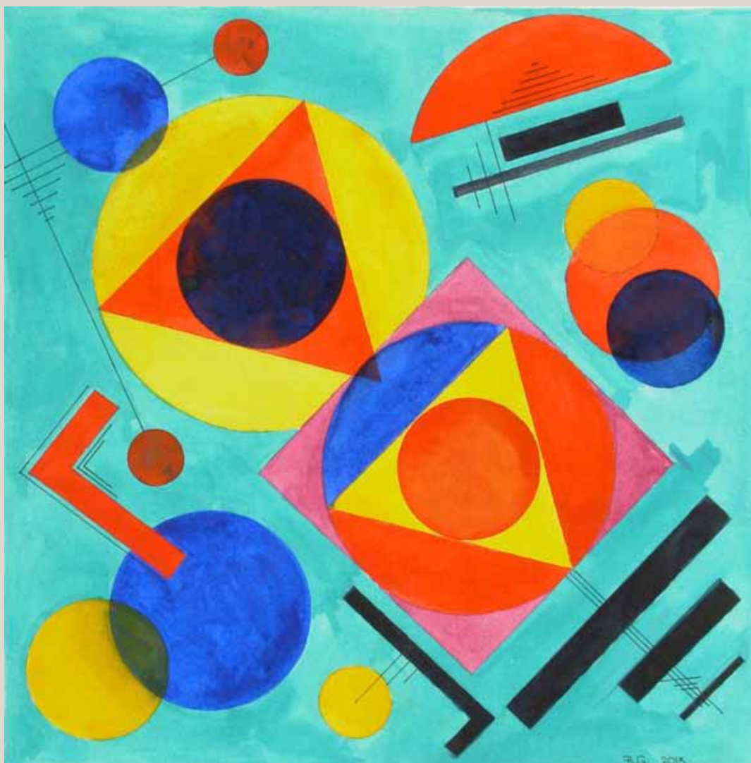
Abstract, Kandinsky Influence