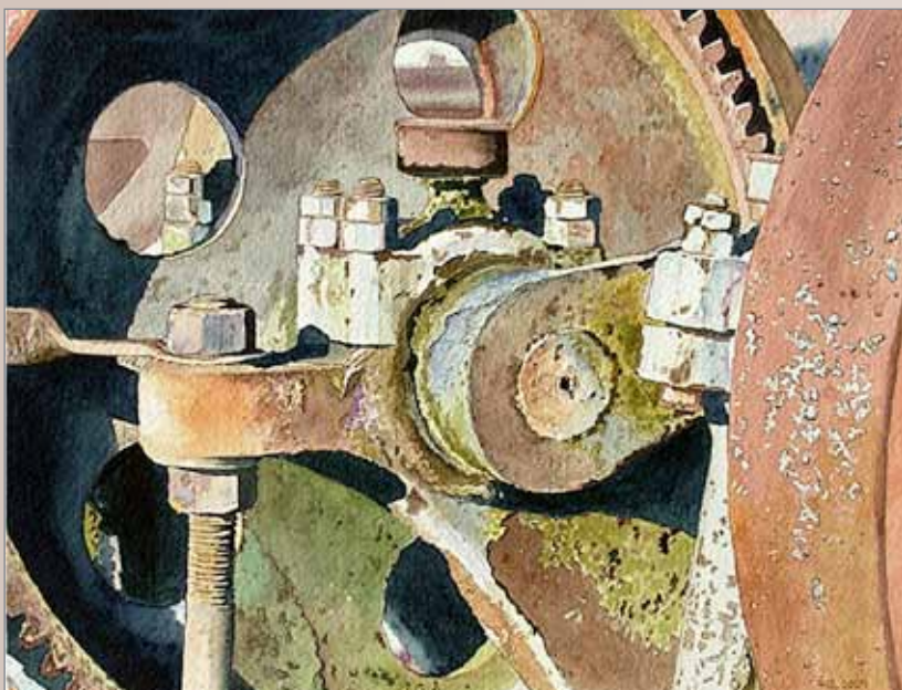
Ghost in the Machine

Adriaen van Ostade [Dutch Baroque Era, 1610-1685]