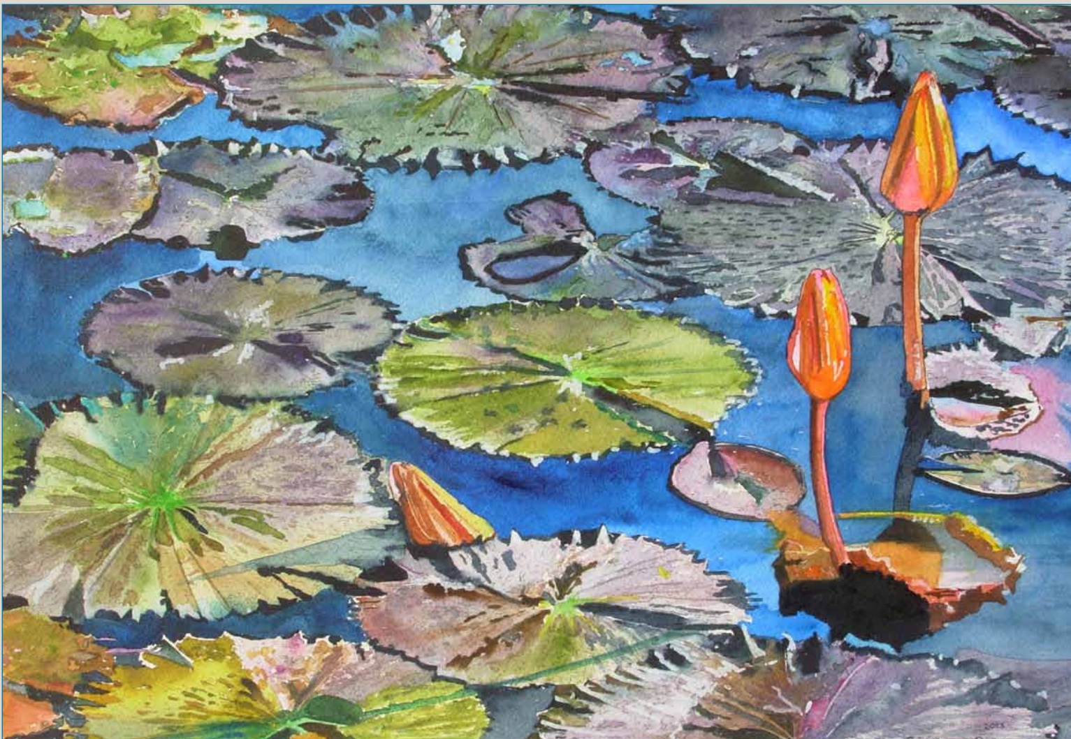
The Water Lilies