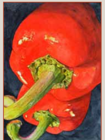
The Red Peppers SOLD